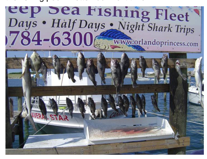
The group's "catch of the day," which include two sharks, a parrot fish, and two sharks.

Although it was hot, no one seemed to mind while the fish were jumping in the boat. Many of the fish were too small to keep, but there were quite a few that were brought back to the dock with us. In spite of the fact that two of the trip participants were from the Michigan Section, neither of us managed to win the fishing pool. Better luck next time.