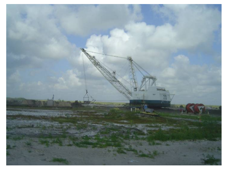
The phosphate mining drag line with its 55 cubic yard "bucket" in action.

The second field trip I attended was to the phosphate mining district southwest of Orlando. This district has supplied about 75 percent of the phosphate needs of the US since mining began. We had the opportunity to see (and ride in) one of the large drag lines used to mine the phosphate deposits, and see how the ore is turned into a slurry using a large water cannon (about 300 psi and 13,000 gpm), and pumped to the processing plant.